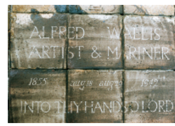
Alfred Wallis's grave, St Ives.