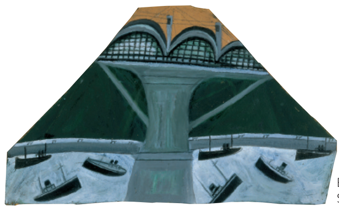
Boats Under Saltash Bridge.