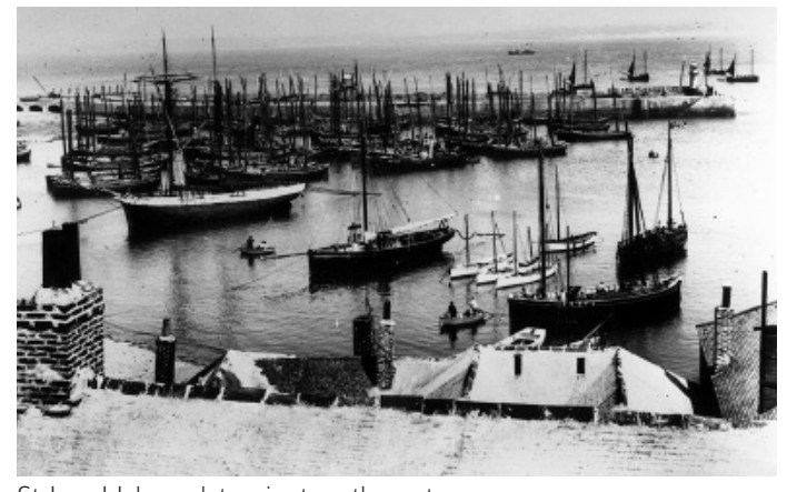
St Ives Habour, late nineteenth century.