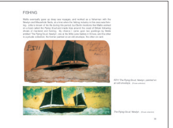
Example of a typical double page spread