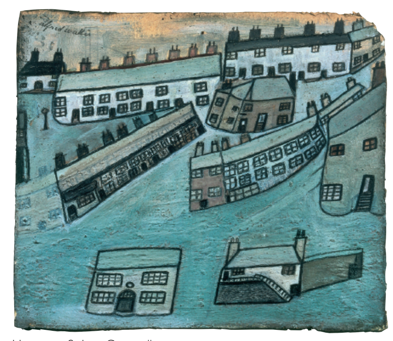
Houses at St Ives, Cornwall.